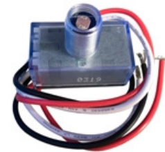
WPA - PHOTO Photocell Sensor