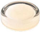
TG Transparent glass