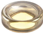
AG** Amber glass