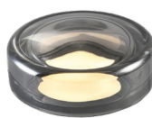
CG** Chrome glass

MFR4 - 4" Fire rated metallic electrical j-box housing