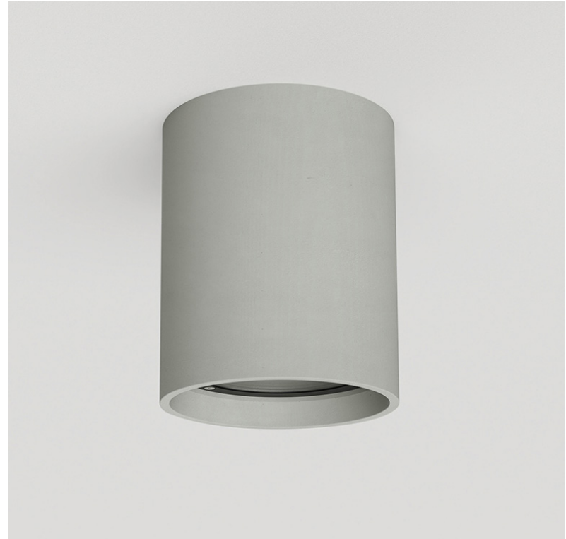
AVAILABLE FINISH: SHOWN IS 4"

*Delivered lumen may vary, refer to photometric for full performance data