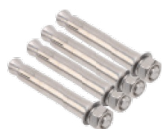
4PCS BOLTS *Included